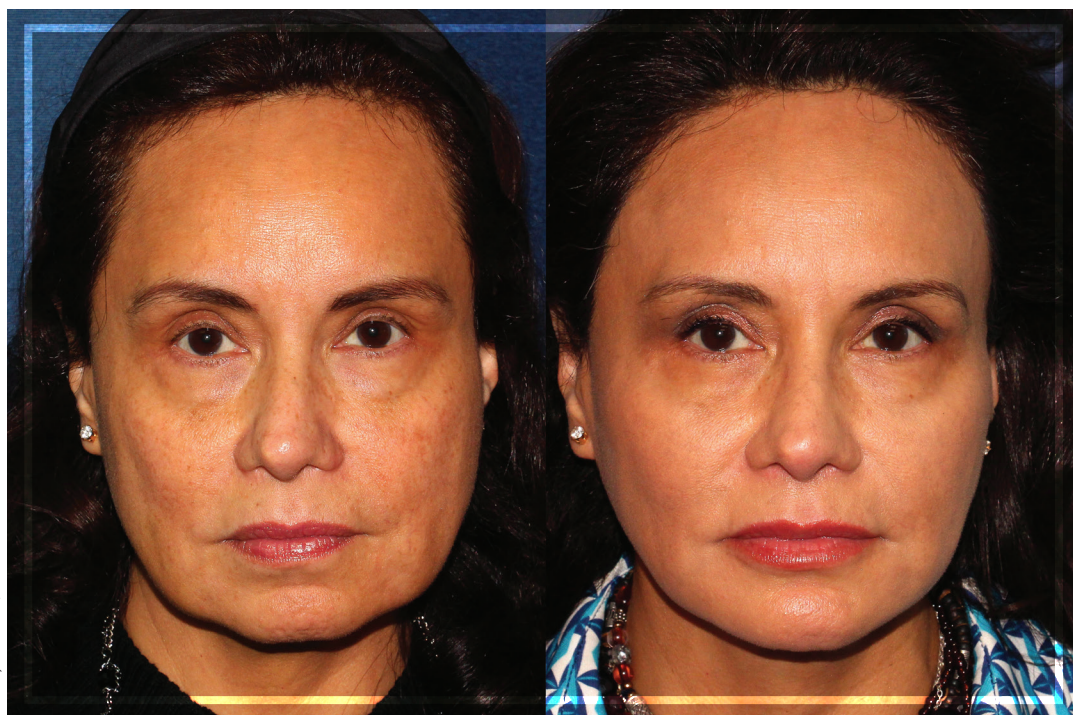
Figure 6. A 60-year-old before (left) and 1 year after (right) Ultherapy (Merz Aesthetics), Clear and Brilliant Permea (Solta Medical), Juvéderm Voluma (Allergan) to cheeks, Radiesse (Merz Aesthetics) to jawline, Restylane Lyft (Galderma) to chin/prejowl sulcus, Restylane Silk (Galderma) to lips, and Botox (Allergan) to masseters, DAO, and upper face.

that patients can truly appreciate how far they have come.