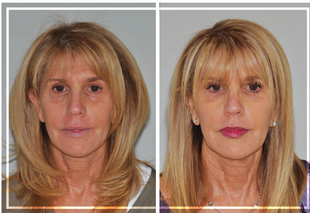
Figure 2. Before (left) and after (right) series of treatments. Treatment 1: 2 vials of Sculptra (Galderma) each at Week 1 and Week 6. Treatment 2 (3 months later): 1 syringe of Juvéderm Voluma (Allergan) to the midface, 20 units of Botox (Allergan) to the glabella, 5 units to the frontalis, and 10 units to each lateral orbicularis oculi. Treatment 3 (3 months later): Full-face fractionated CO 2 laser resurfacing.

face with neuromodulator in the masseter is a nice tool that then really changes proportions and doesn't require all this filler in the mid-face for the contour effect."