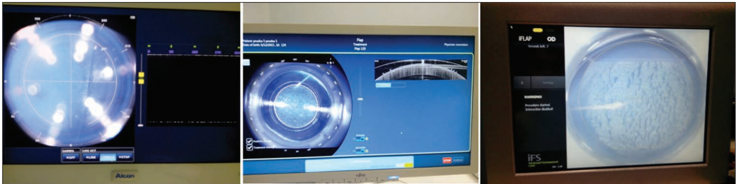
Figure 3. Dr. Teus measured and compared the real IOP increase while performing a FemtoLASIK corneal flap with the LenSx, Victus, and the IntraLase iFS 150 devices (with curved and flat interfaces, respectively).

increased by 20 mm of mercury. The IOP was very high in order to obtain a good quality flap. You can cut perfectly with high IOP. Then you should try to lower the IOP if you need to while keeping the same quality of flap. I see no reason to go away from high IOP during surgery.