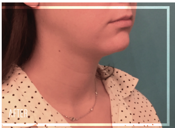
24-year-old treated with Kybella: 2 Tx: 2.5 Vials; 2 Vials