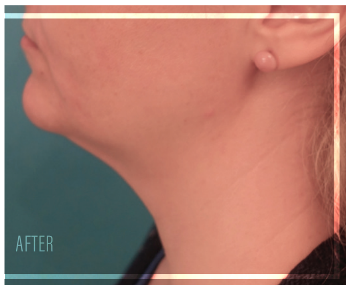
44-year-old treated with Kybella: 2 Tx: 3.5 Vials; 3 Vials;