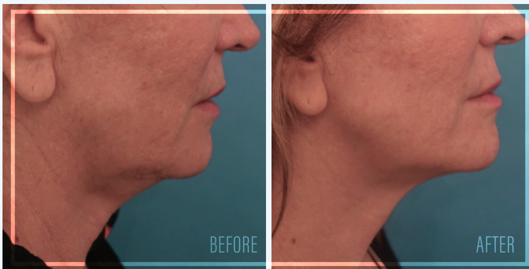
65-year-old patient: 1 Tx, 4 Vials Kybella in submental and jowl, jawline filler with Voluma.