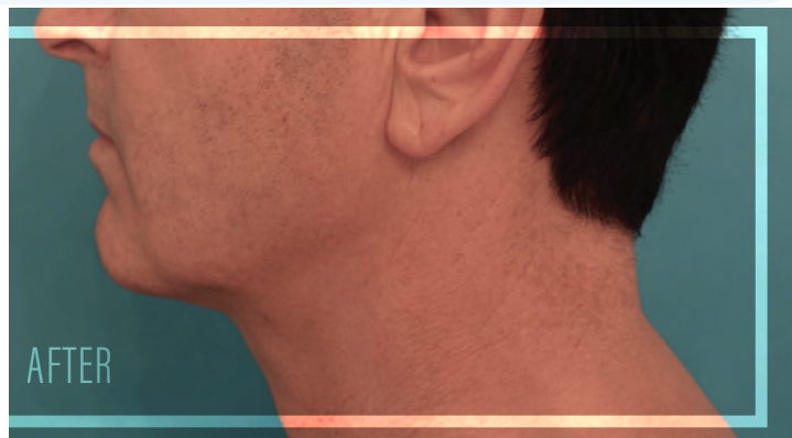
55-year-old treated with Kybella: 2 Tx: 4 Vials; 3 Vials; Photos courtesy of Dr. Shridharani.